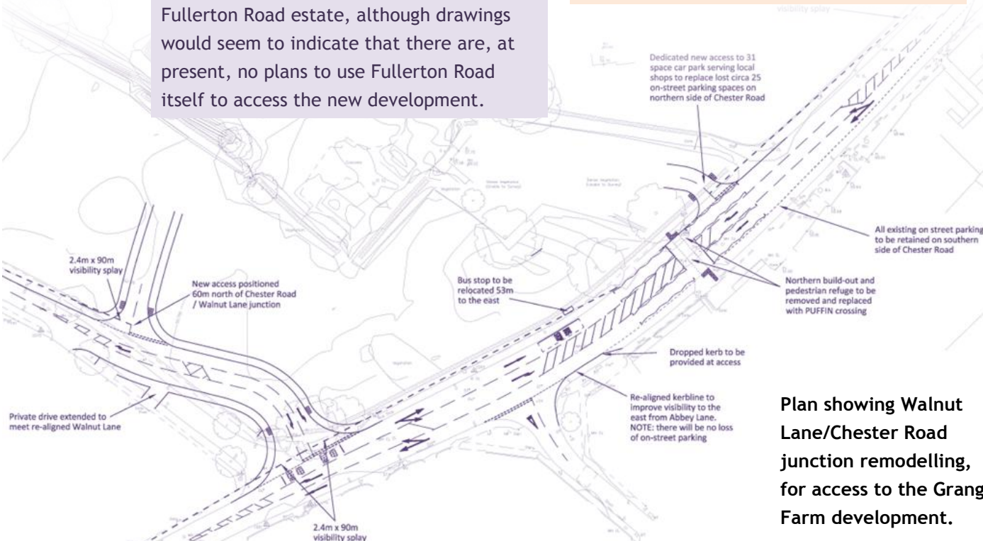
Plan showing Walnut Lane/Chester Road junction remodelling, for access to the Grange Farm development.

Two road entrances onto the Hollies Farm site are planned. The “primary” access is at a junction with School Lane and over an embankment across the pond next to Hartford Hall Hotel (a planning application for a bridge across the pond is currently being considered). The other, “secondary”, access is via Douglas Close. Further pedestrian/cycle access from the footpath along the River Weaver and from Marshall’s Arm Local Nature Reserve.